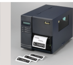
> Cutter mode