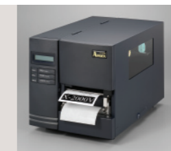
> Dispenser mode