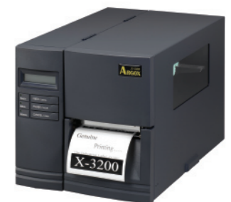
NEW! X-3200 300dpi