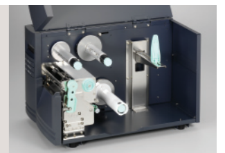
> Inside of X-series