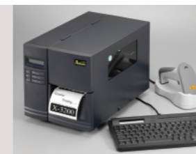
> X Series, Argokey & Scanner