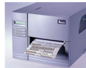
> G-series provides wide 6" printing

The G-6000 offers the industrial standard 6 inch width to give you high speed performance and greater extension of the printing area. Built-in LCD display, 1 MB flash memory, PS/2 interface for your PC keyboard provides the essential structure for Plug and Play stand-alone operation. Perfectly designed metal case resists rough treatment, heat, and dust, and ensures continuous quality operation, even in the most demanding environments. Superior historical control enhances high printing quality, and is perfect for printing of barcode and small alphanumeric. The G-6000 is simple to operate and it is easy for the user to perform adjustments and maintenance.