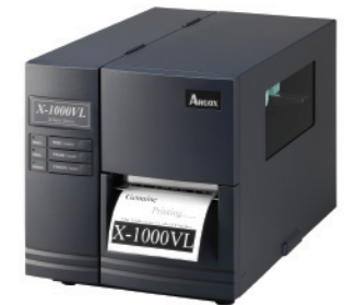
NEW! X-1000VL 203dpi